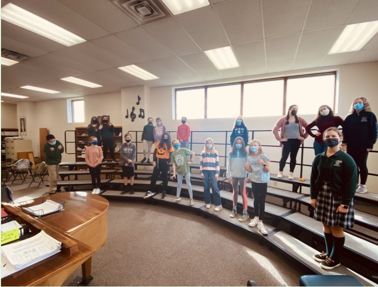
Junior High Chorus is rehearsing hard for Bishop Ludden's Christmas Concert, to be held at 7 p.m. Wednesday, Dec. 22!