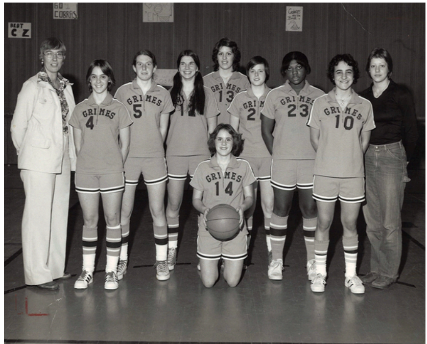
Bishop Grimes girls basketball team (1970s)

Have throwback photos to share? Email them to akulak@syrdiocese.org